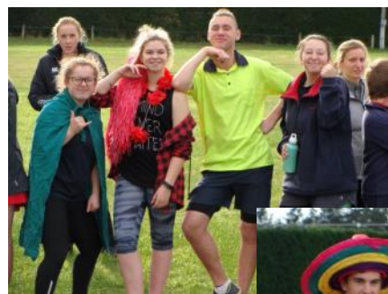
Some of the Year 13s, ready to climb the Power's hill for the last time, before the start of Cross Country.